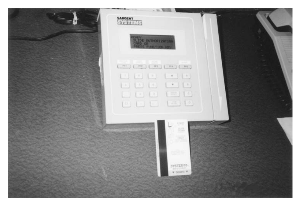
Figure 7-14. An electronic device is used to prepare new electronic room keys for guests.

of the guests with reservations who are expected to arrive (Figure 7-16). The group arrivals report option lists the various groups with reservations that are expected to arrive (Figure 7-17).