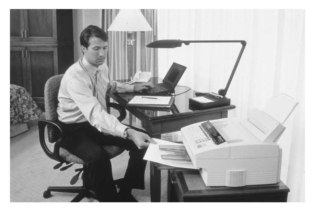
Figure 7-2. This room is equipped with such amenities as a computer and in-room fax to facilitate the business guest's stay.