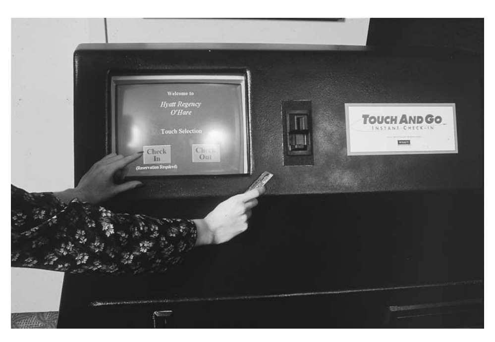
Figure 7-20. A guest may choose to use the self-check-in option of a property management system. The process is initiated with a credit card.